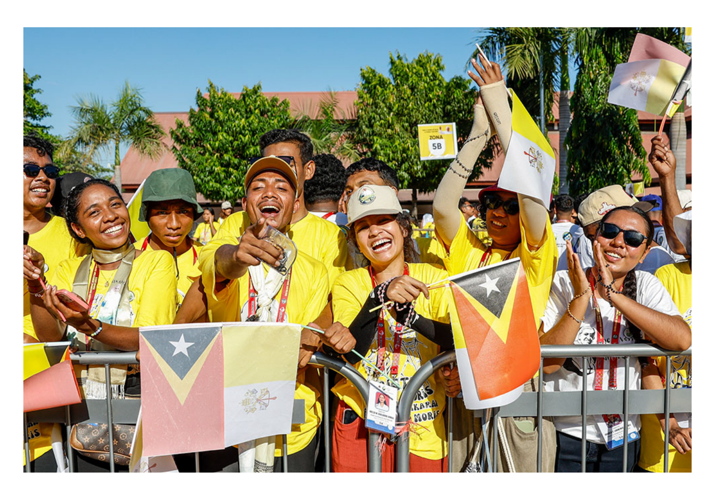
Young people wait for Pope Francis outside a convention center in Dili, Timor-Leste, Sept. 11.

This goes against numerous discourses about the church in Asia — something supposedly marginal, poor, and left from the colonial past. This papal trip was a reminder that it is urgent to question our <u>modernist biases about Catholicism</u>.