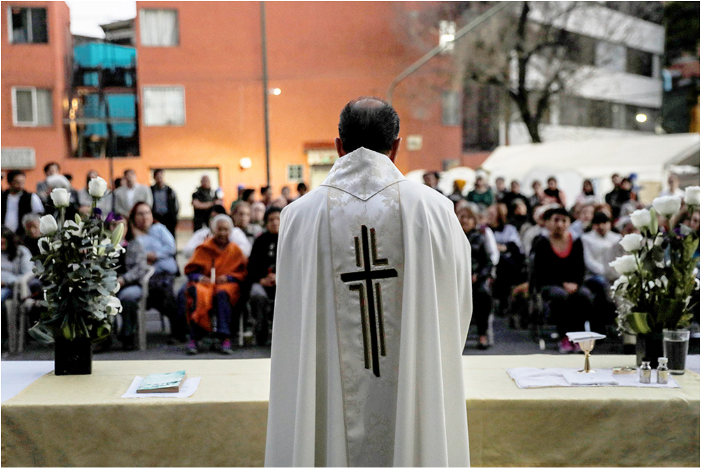
A priest celebrates Mass in Mexico City Jan. 11, 2018.