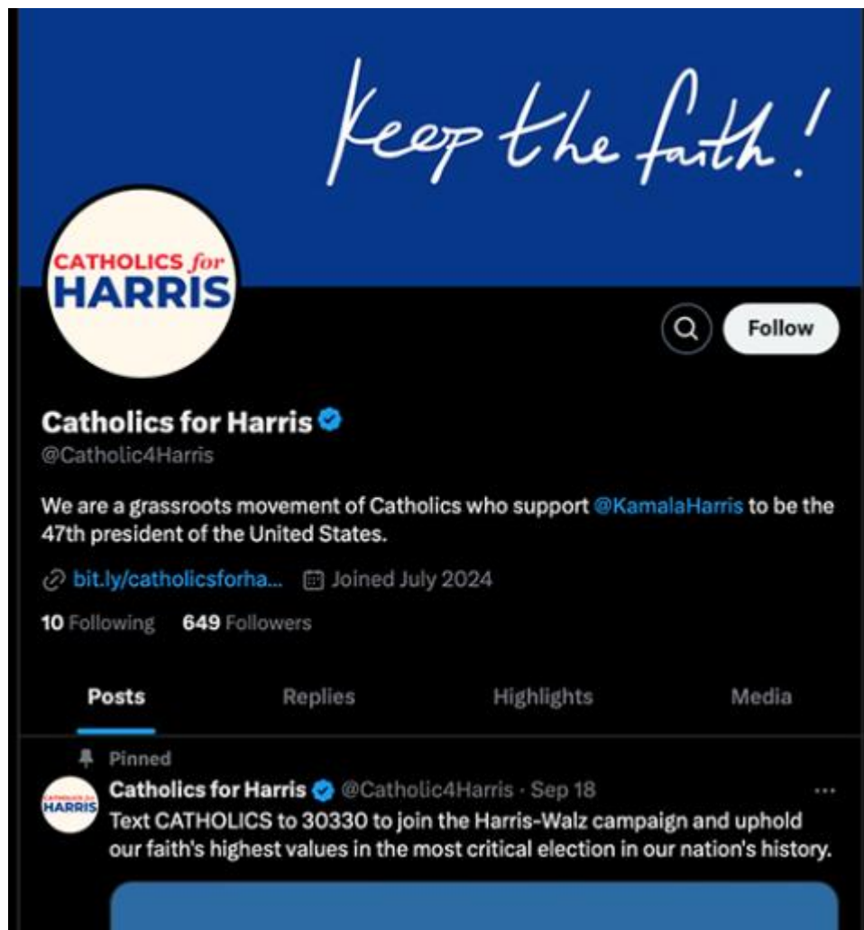
A screenshot of the Catholics for Harris account on X