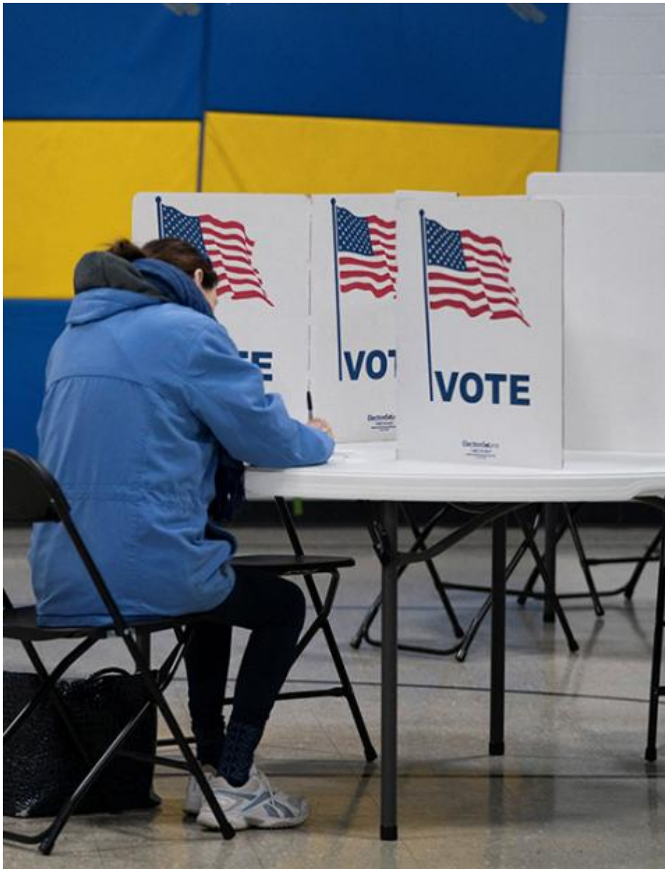
A woman prepares to vote in the presidential primary election at a polling place April 2 in Superior, Wisconsin.

Overall, Catholic voters in battleground states are motivated by pocketbook issues, with three of every four respondents saying the economy was the most important issue to them in this election. Other top issues were immigration/the border (60%), health care (53%), taxes (52%), affordable housing (46%), fighting crime (42%), gun control/Second Amendment rights (41%) and abortion/reproductive rights (37%).