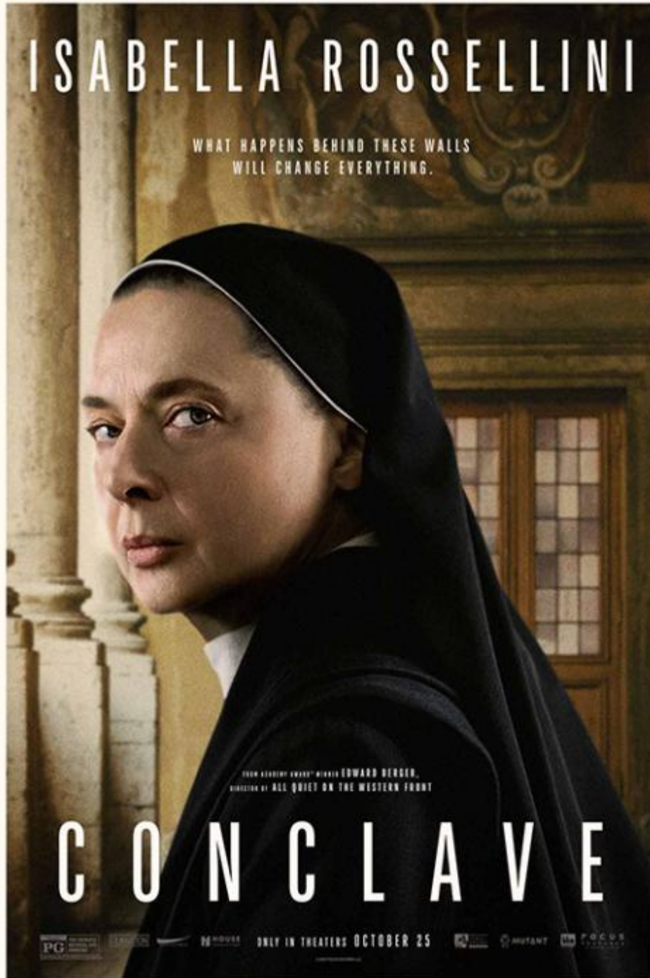
Isabella Rossellini stars in "Conclave."

Rossellini: I loved Lawrence's speech about doubt. Whether it's society or the church, we forget that we're humans, prone to make mistakes due to our limited understanding. The film reminds you of that. I like that the film ends with a big question mark in many ways. The pope that is selected is not the one people expected, but he is the one who has dedicated his life to the poor and needy.