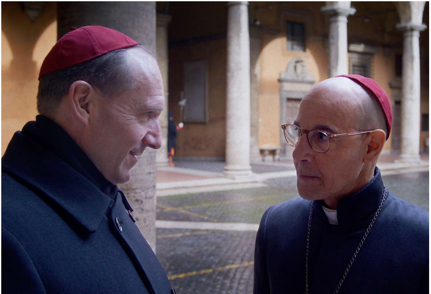
Ralph Fiennes, left, is pictured as Cardinal Lawrence and Stanley Tucci as Cardinal Bellini in director Edward Berger's "Conclave."

In many ways, I think acting is closer to a sport like tennis. If my opponent — in this case, my director or scene partner — hits the ball to me, how I respond to what they send my way has to be dictated in the moment. I may come up with a strategy or way to play the game but intellectual and cerebral thinking only goes so far. At the end of the day, I have to be open, for example, to how Stanley Tucci [who stars as Cardinal Bellini] is going to play the scene. In the scenes where we're debating and things get heated, I gave a lot of thought to the emotions between us. We both were following our instincts together and that makes each take different too.