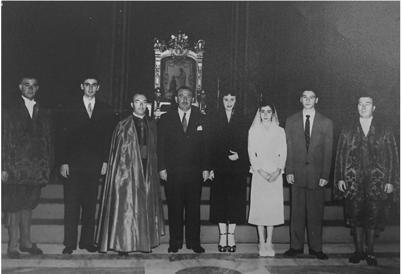
Former House Speaker Nancy Pelosi (in white dress) with her family during a visit at the Vatican in 1954.

Then, she paused, closed her eyes and quoted the Gospel of Matthew. " 'When I was hungry, you fed me. When I was naked, you clothed me. When I was homeless, you sheltered me. When I was a stranger, you welcomed me. When I was in prison, you visited me' — except right now," she said.