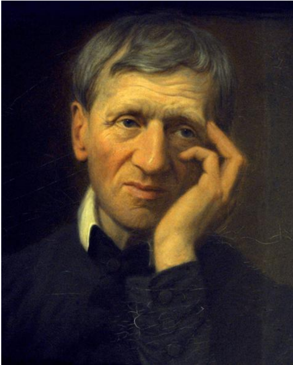
St. John Henry Newman, pictured in an undated painting