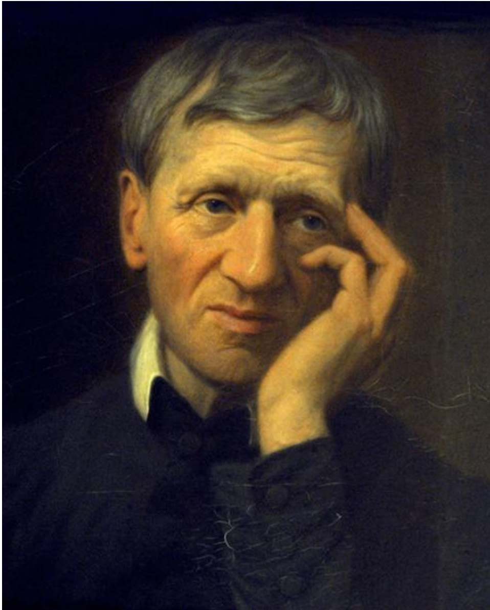
St. John Henry Newman, pictured in an undated painting