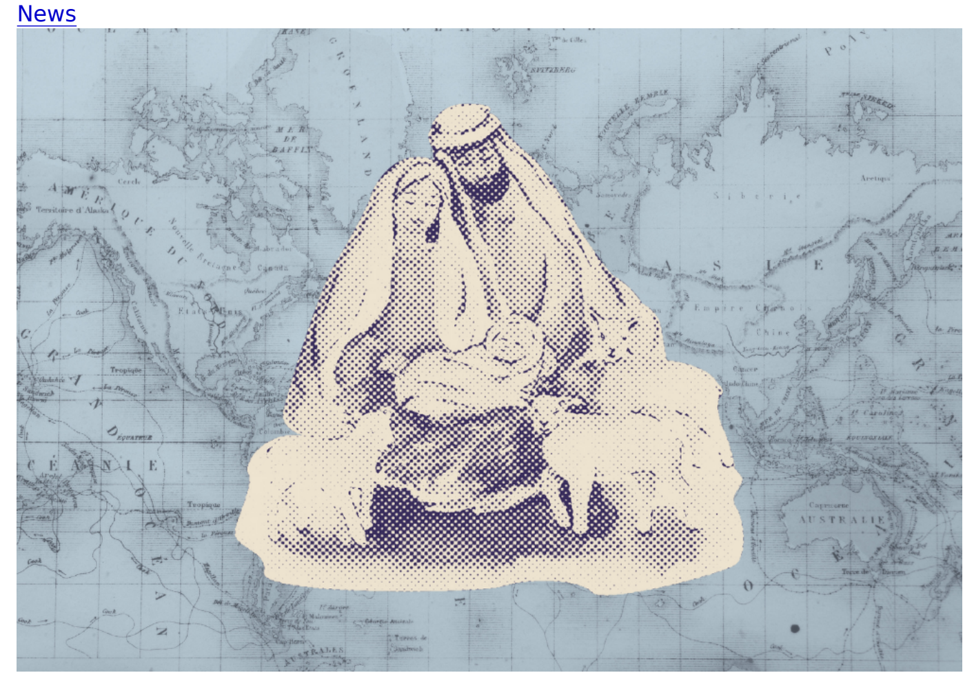
(GSR illustration/Olivia Bardo)