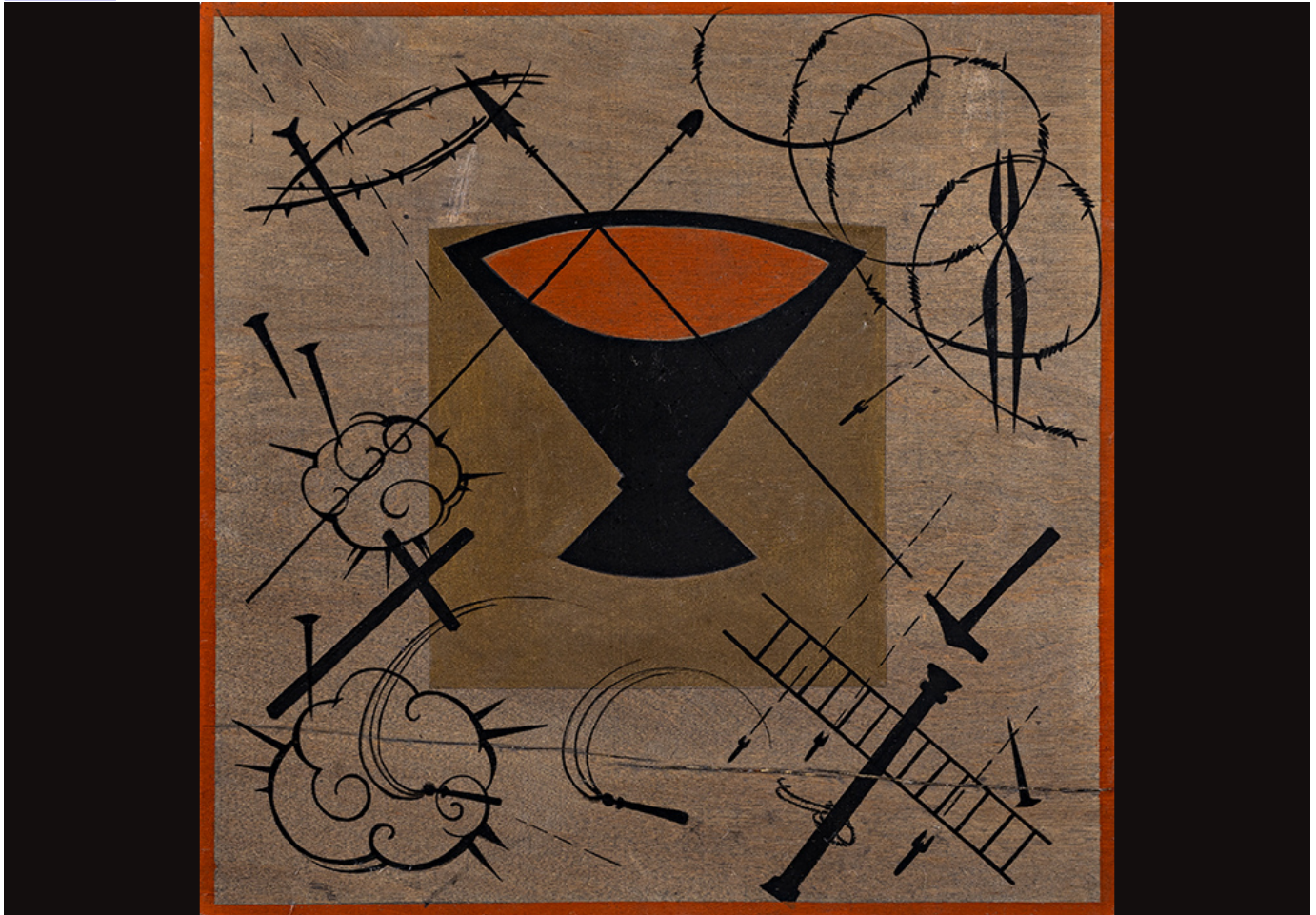
"The Cup of the Covenant" by Kateryna Haneychuk