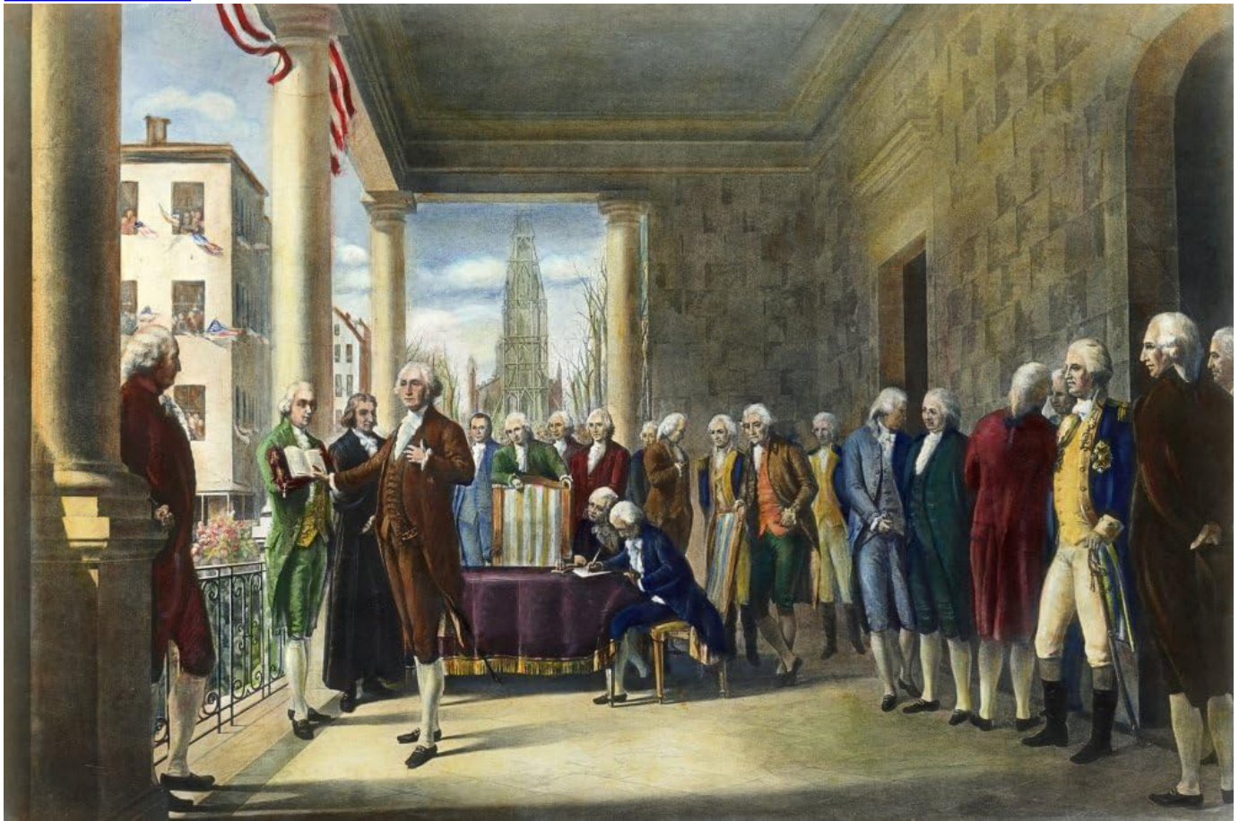
Oil painting of George Washington's inauguration as the first President of the United States which took place on April 30, 1789. (Ramon de Elorriaga/Encyclopedia Britannica/Wikimedia Commons)