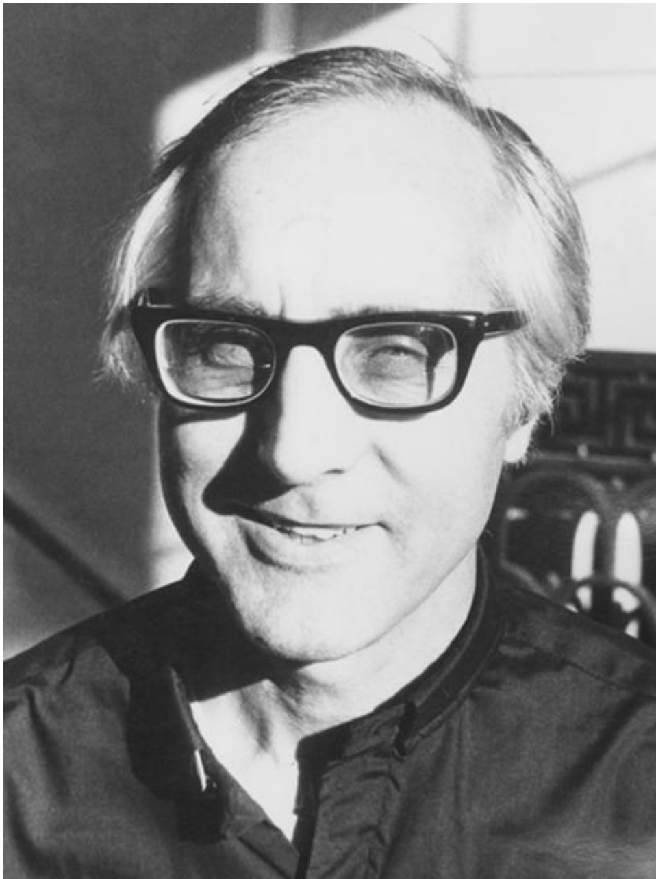
Detroit Auxiliary Bishop Thomas Gumbleton in 1979

The bishops, USCC staff were quick to note, cannot go back on their positions. This will mean the USCC and other Washington religious groups with similar views may find themselves being among the few powerful organizations looking after the interests of the poor and the powerless in this country and elsewhere in a time of budget cuts and tax cuts in domestic policy; and military jingoism in foreign affairs.