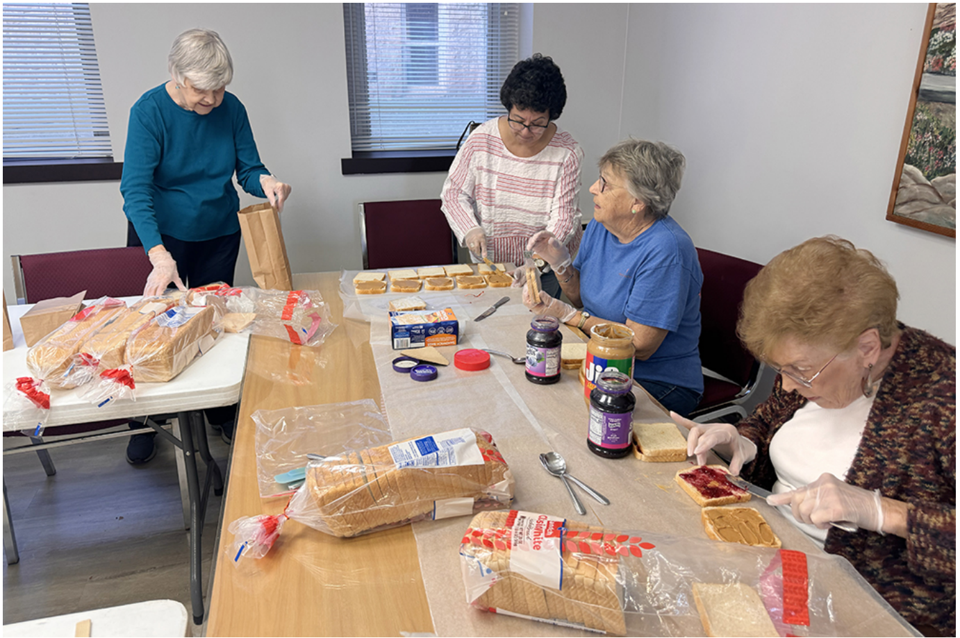
Associates of the Ursuline Sisters of Louisville make sandwiches for the homeless in Louisville, Kentucky.