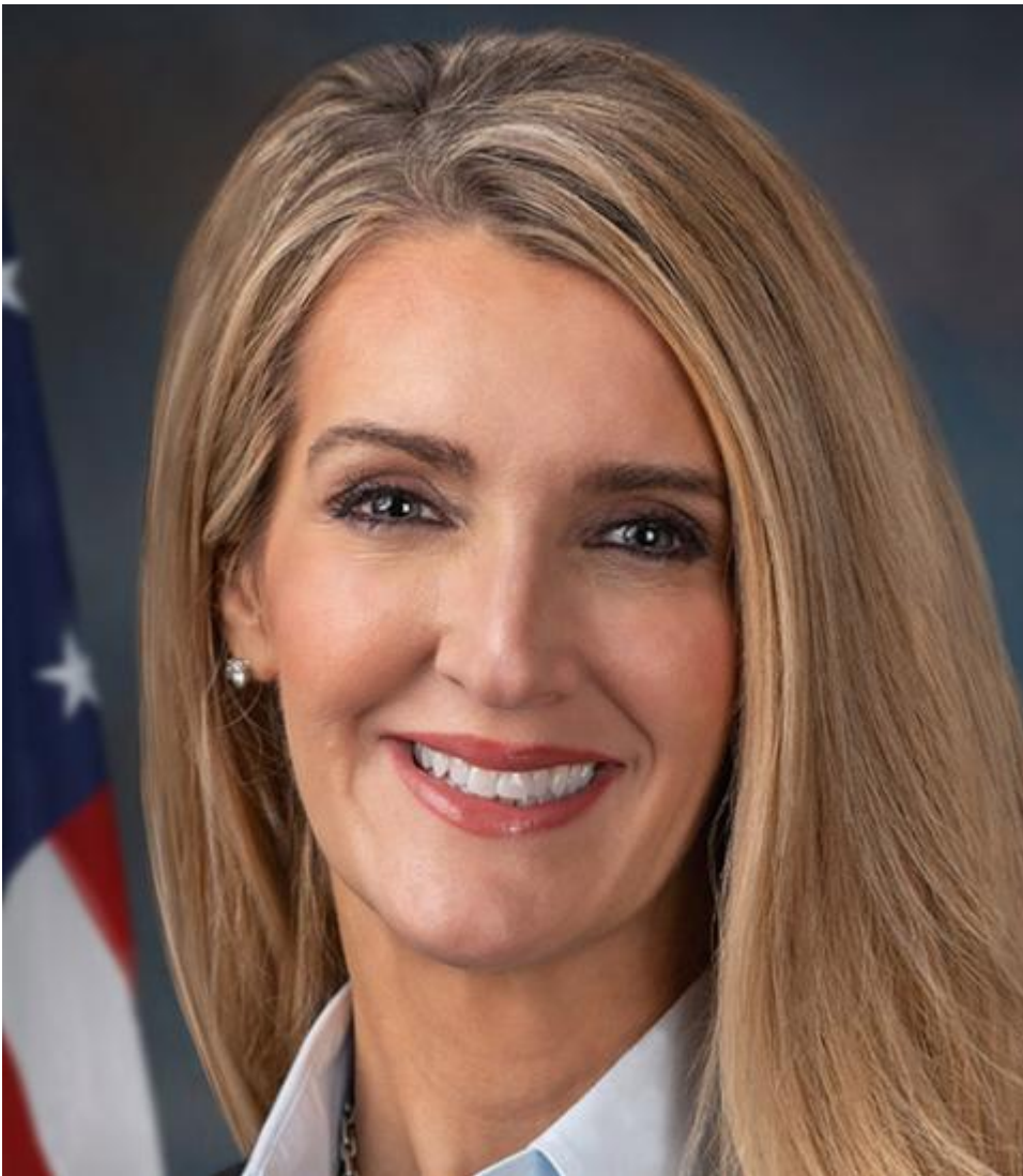
Kelly Loeffler

Faith background: In an interview with EWTN, Kennedy said that his faith helped him overcome his drug addictions. His Catholic faith, specifically St. Francis of Assisi, is also said to have inspired his environmental activism. He wrote a children's book about St. Francis.