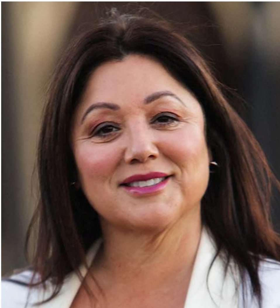
Lori Chavez-DeRemer

Faith background: Faith is an important part of the Duffys' family life, according to Campos-Duffy, who said they go to Mass and pray together. Duffy was sworn in as transportation secretary on a study Bible by Catholic apologist Scott Hahn of Franciscan University at Steubenville, Ohio.