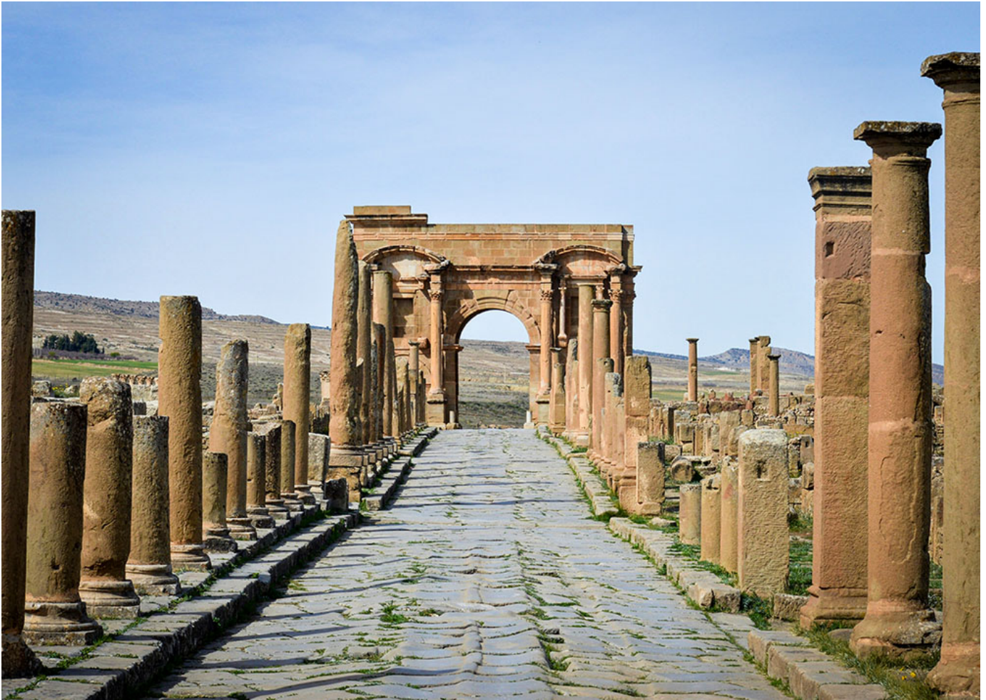
Ruins of the Roman Empire in the province of Batna, Algeria