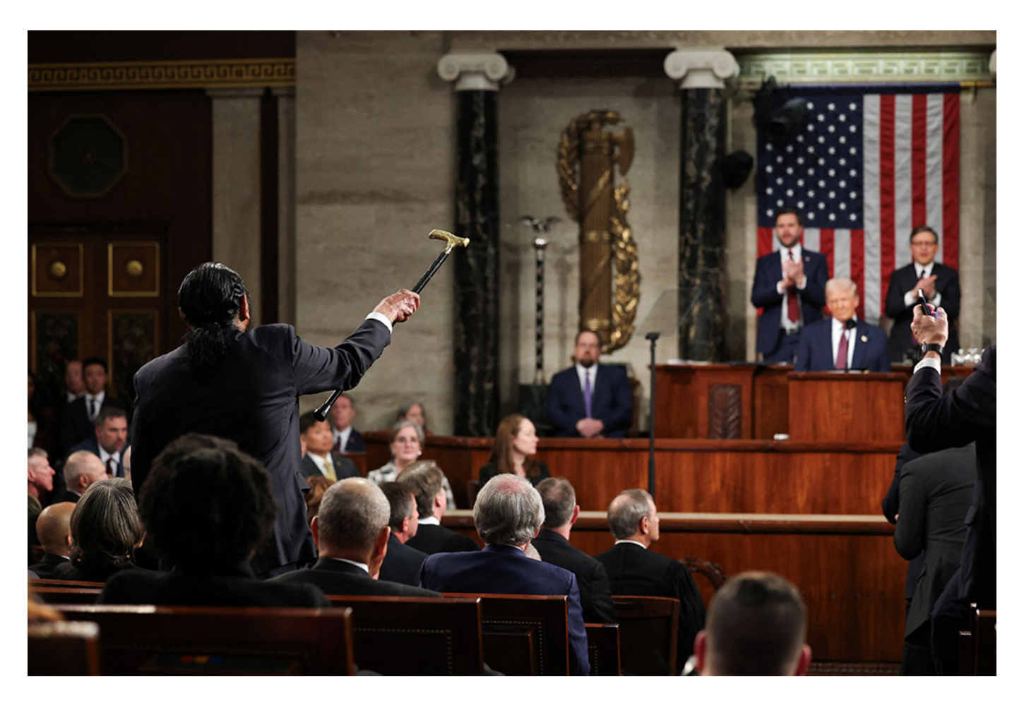
Rep. Al Green, D-Texas, gestures as U.S. President Donald Trump addresses a joint session of Congress at the U.S. Capitol in Washington March 4, 2025.

And unfortunately, it was just the beginning of a long process of this jeering and cat calling and just watching, I had a perfect vantage point to see this. You know, the Republican side standing up, cheering all the time. The Democrats never acknowledging anything.