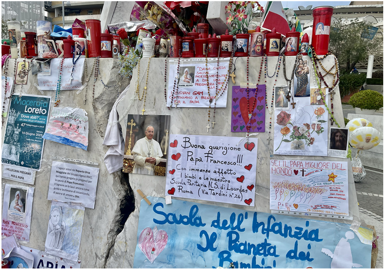
The statue of St. John Paul II at Gemelli Hospital is surrounded by dozens of candles, hanging rosaries and drawings or photographs of Pope Francis with messages of all sizes, shapes and colors, wishing him a speedy recovery.