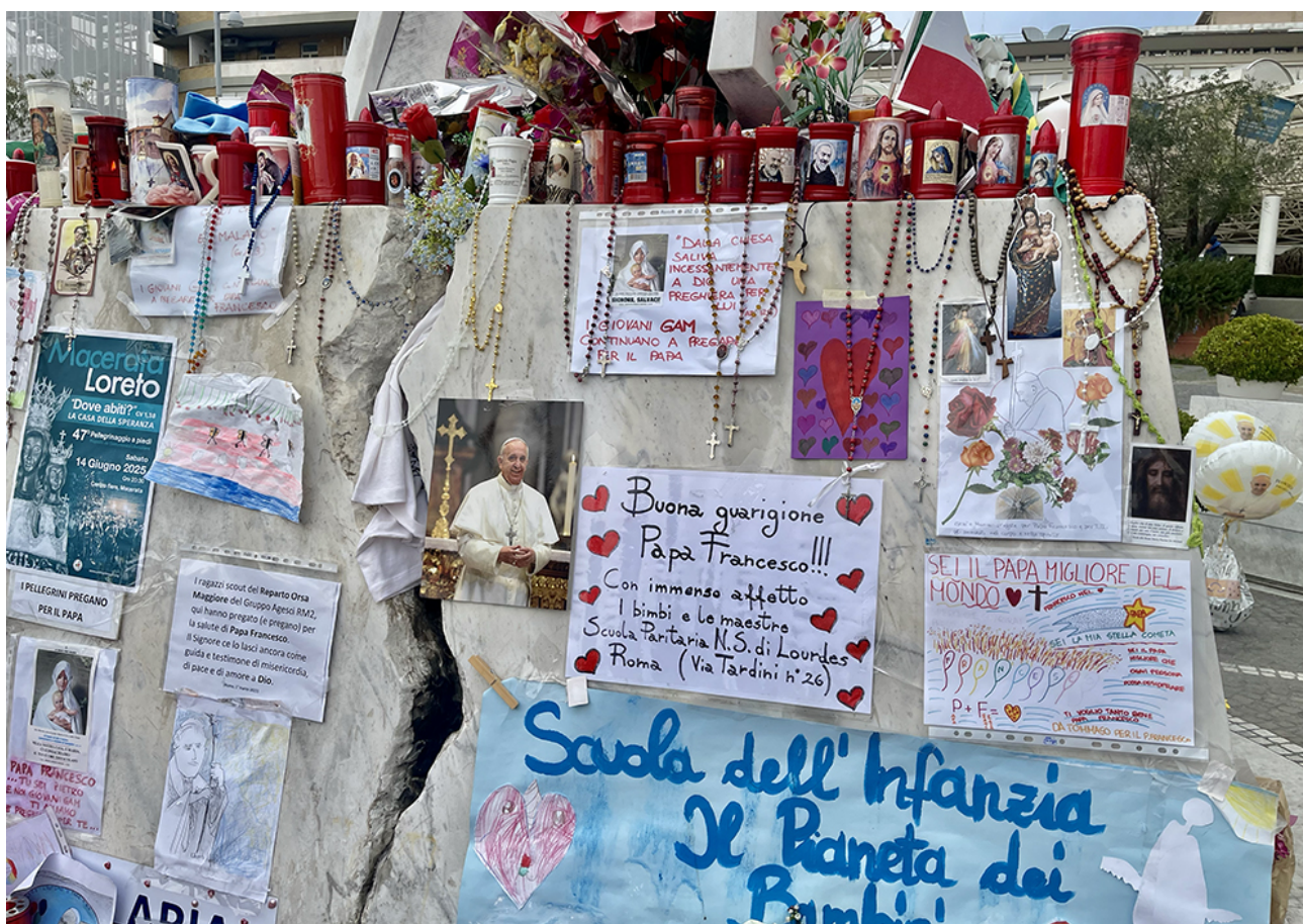
The statue of St. John Paul II at Gemelli Hospital is surrounded by dozens of candles, hanging rosaries and drawings or photographs of Pope Francis with messages of all sizes, shapes and colors, wishing him a speedy recovery.