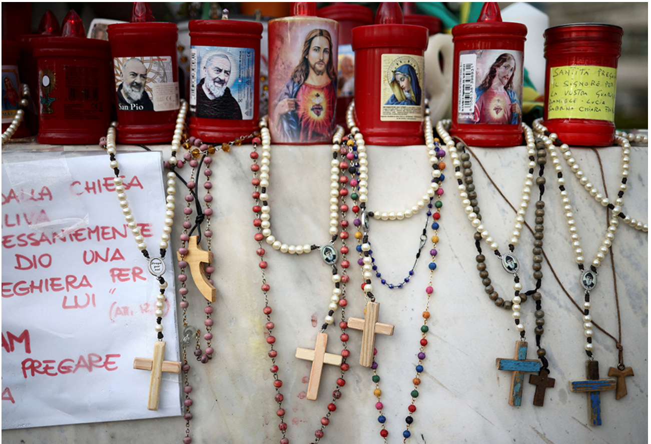
Rosaries hang from the base of the statue of St. John Paul II outside Rome's Gemelli Hospital March 10, where Pope Francis was admitted for double pneumonia Feb. 14.