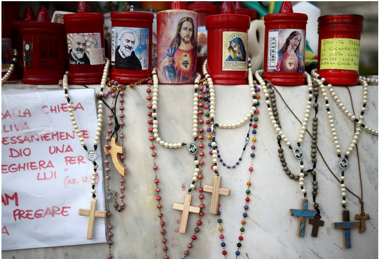
Rosaries hang from the base of the statue of St. John Paul II outside Rome's Gemelli Hospital March 10, where Pope Francis was admitted for double pneumonia Feb. 14.