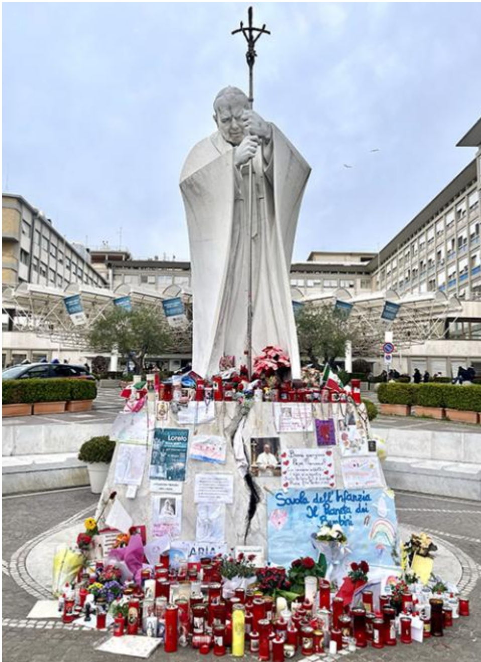
The statue of St. John Paul II at Gemelli Hospital