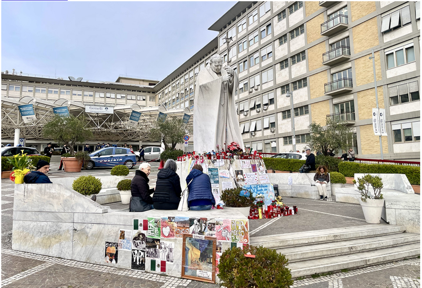
The St. John Paul II statue is pictured in the main courtyard at Gemelli Hospital in Rome.