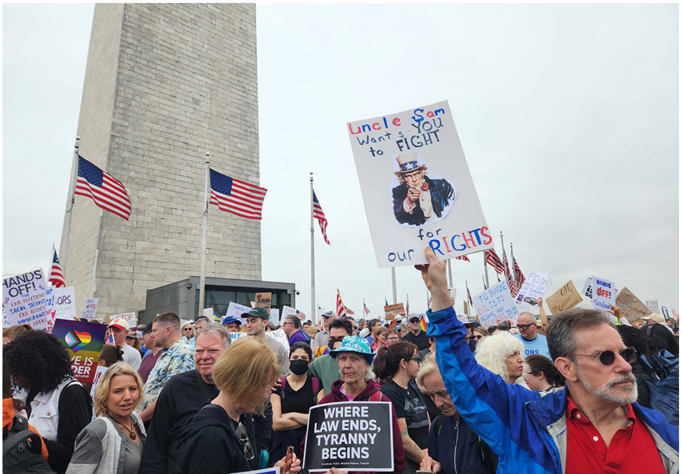
Demonstrators stand at the foot of the Washington Monument on the National Mall during the April 5 "Hands Off!" demonstration in Washington, D.C.

That was a sentiment shared by others in an informal group of more than a dozen faith-based activists — sisters of different congregations, lay associates, supporters — who marched to the Washington rally together.