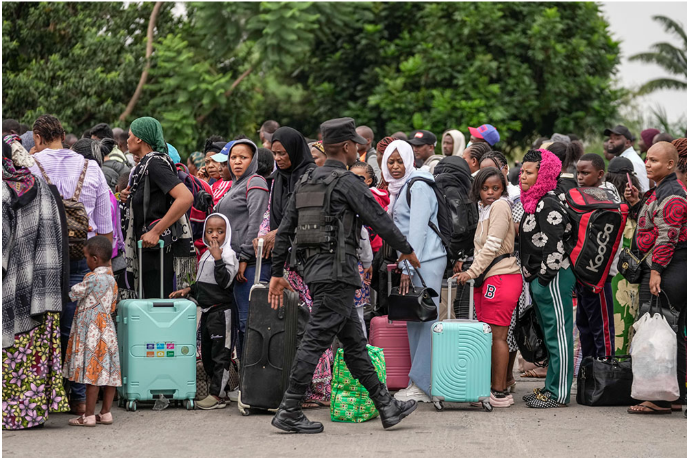
Rwanda security officials check people crossing from Congo in Gisenyi, Rwanda, Jan. 29, 2025, following M23 rebels' advances into eastern Congo's capital Goma.

Catholic leaders, including religious sisters active in the region, say that thousands of women and girls have sought refuge in neighboring countries such as Uganda, Burundi and Rwanda to escape sexual violence. The number of those fleeing increased earlier this year following the invasion of the region by M23, they said.