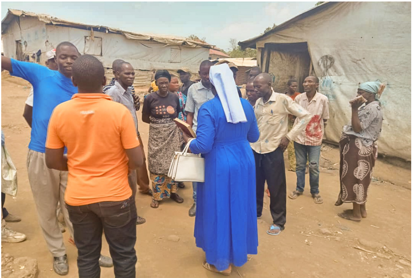
A sister visits displaced individuals, including women and girls, in a camp in the eastern town of Goma, Democratic Republic of Congo.

To document the unfolding diaspora and the horrors of the decadelong war, NCR's Global Sisters Report went to Central Africa and interviewed victims and their families — and the Catholic sisters who work to care for the people trapped in the continuing warfare.