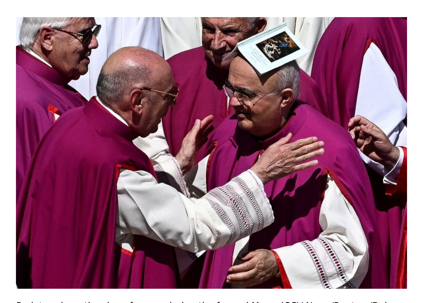
Prelates share the sign of peace during the funeral Mass.